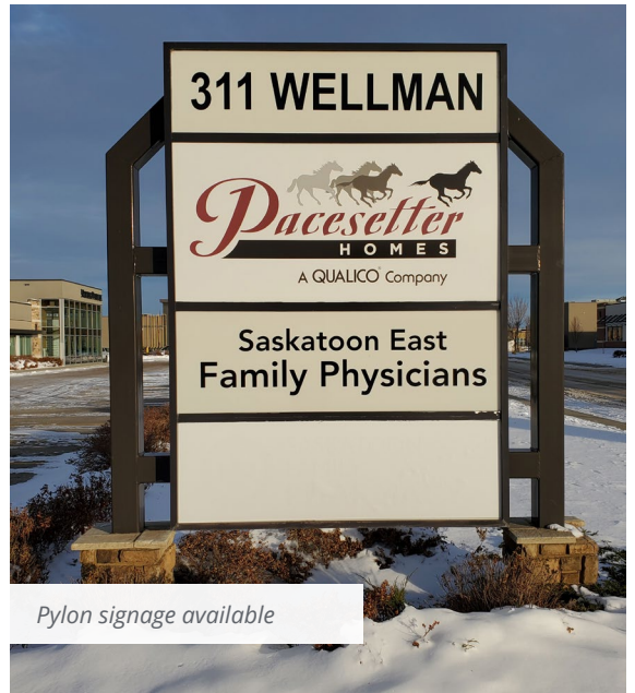
Pylon signage available