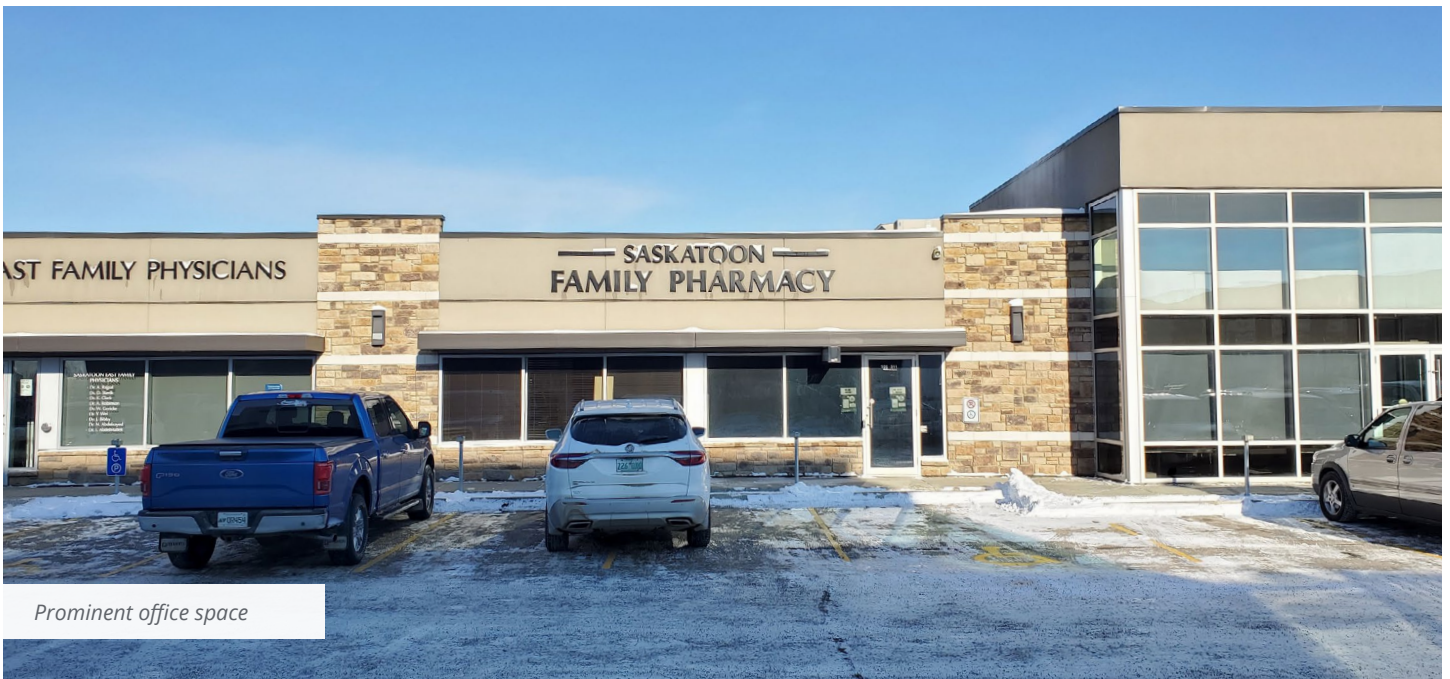
Prominent office space